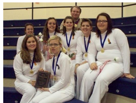
Z with their Gold Medals in 2008