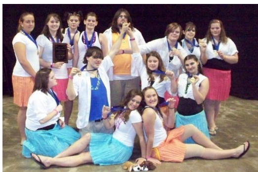
Ability with their Gold Medals in 2009